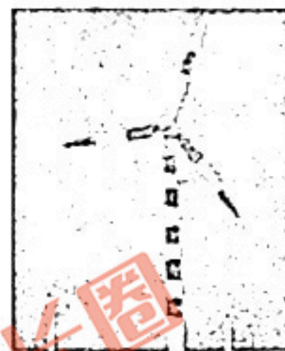
a stripy wind turbine